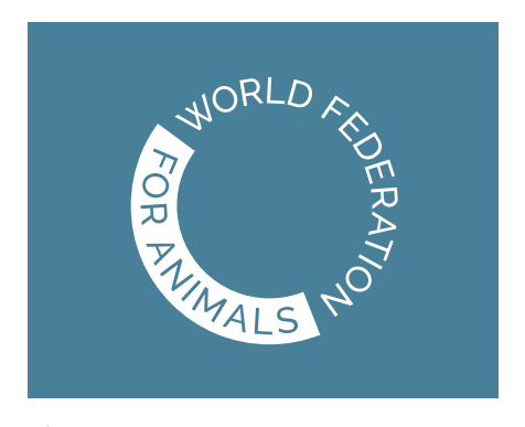
✓ White on WFA Dusty Blue background