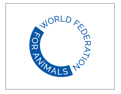
✓ WFA Blue on white background

In cases where it is technically impossible to use or define certain background colors, e.g. on workwear, the logo should in principle only be reproduced in black or white to ensure optimal contrast effect.