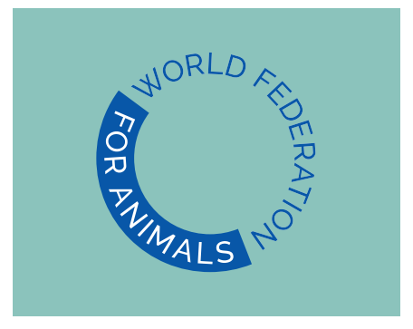
WFA Blue on WFA Turquoise background