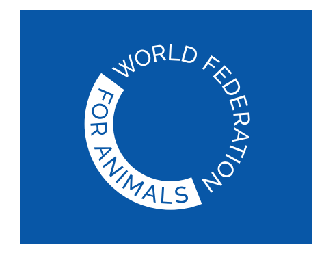
✓ White on WFA Blue