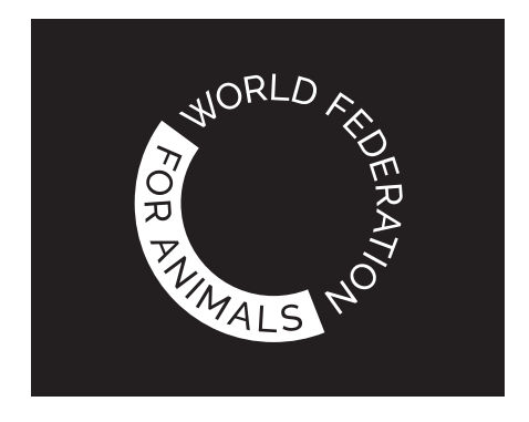
White on black background