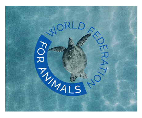
✓ WFA Blue on bright background