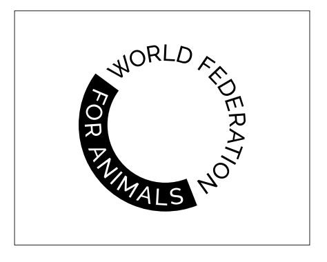
✓ Black on white background